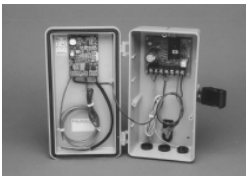
P500B - Basic Probe System

Sure Action's most economical probe system. This system can work on a driveway up to 1000' long and 14' wide. It will detect a vehicle moving as slow as .5 mph and is the simplest to install of all our probe systems.