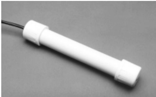
P500 Probe with 50' 22/2 burial cable